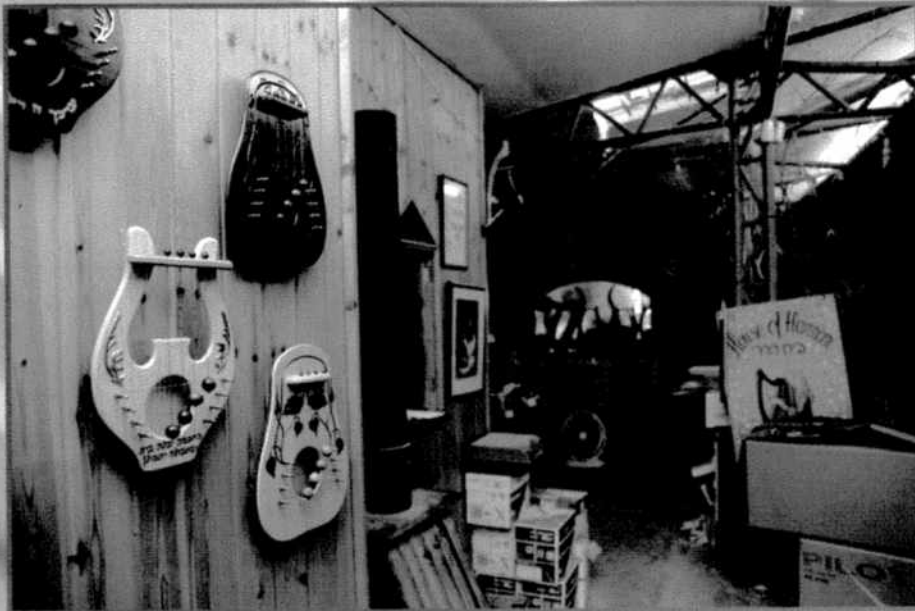
Harp and Lyres on display at the workshop