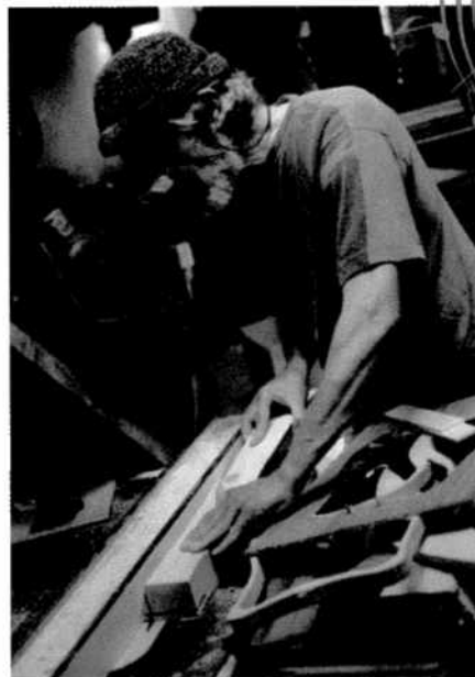
A painstaking process goes into the making of each harp

"We arrived on Erev Rosh HaShanah, and I did not understand why there were cars and trucks on the road in the biblical Land, instead of camels and donkeys...."